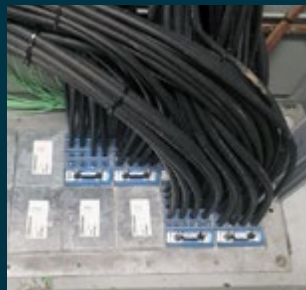
7. PCS enclosures