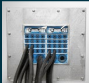
6. Battery storage containers