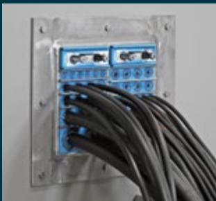
5. Walls and floors

Roxtec cable and pipe seals work efficiently in aboveground and underground walls and floors in buildings, battery storage containers, PCS enclosures and kiosks. Avoid fire, water, humidity and animal issues in your buildings and battery storage containers.